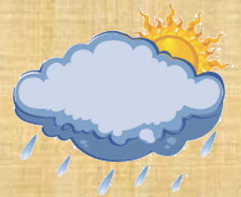
Sun & Rain