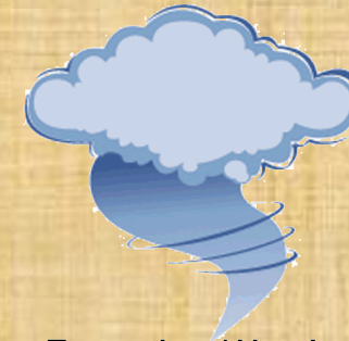
Tornados / Hurricanes